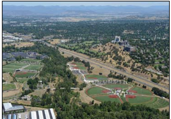
Constructed between 2007 and '15 for $32 million, USCCP surpassed the $100 million mark for economic impact in 2018.

In July, USCCP served as the venue for an Oregon Little League state tournament for the second time, attracting 15