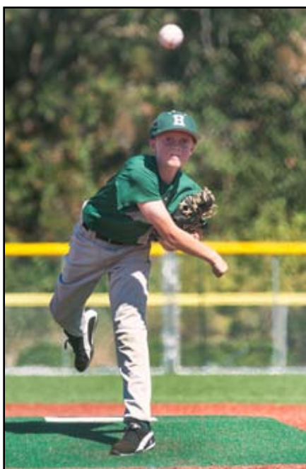
Youth baseball team counts increased for the sixth straight year.

As has become commonplace, Medford's 2,800 hotel rooms were jam-packed Memorial Day weekend as a result of the annual Rogue Valley Timbers Memorial Challenge, which attracted 170 teams, and the City's 47-team youth baseball tournament. The two events combined to generate over $1.6 million in estimated economic impact based on the teams that competed at USCCP.